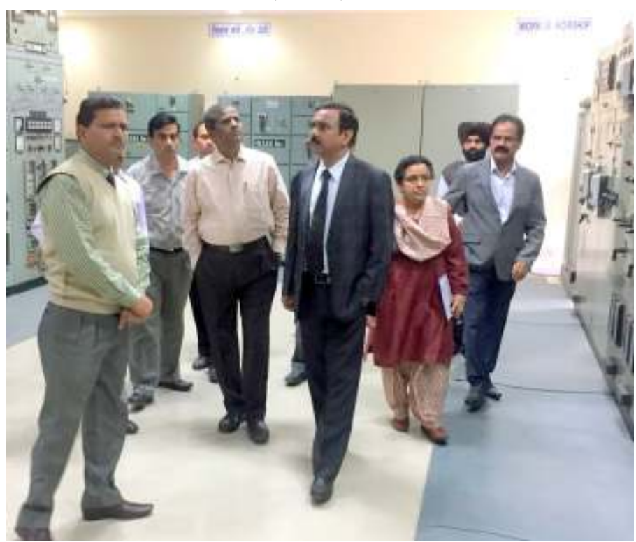
220 KV Sub-Station Ablowal (Patiala) Control room