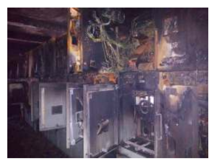
Falling of Kikar tree on 11 KV Behrampur & 11 KV UPS-1 feeders on dated 1.1.2016 lead to heavy fault & switches of both the feeders as well as 11 KV Breakers got burnt