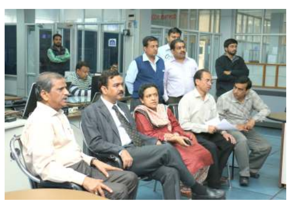
SLDC, PSTCL, Patiala