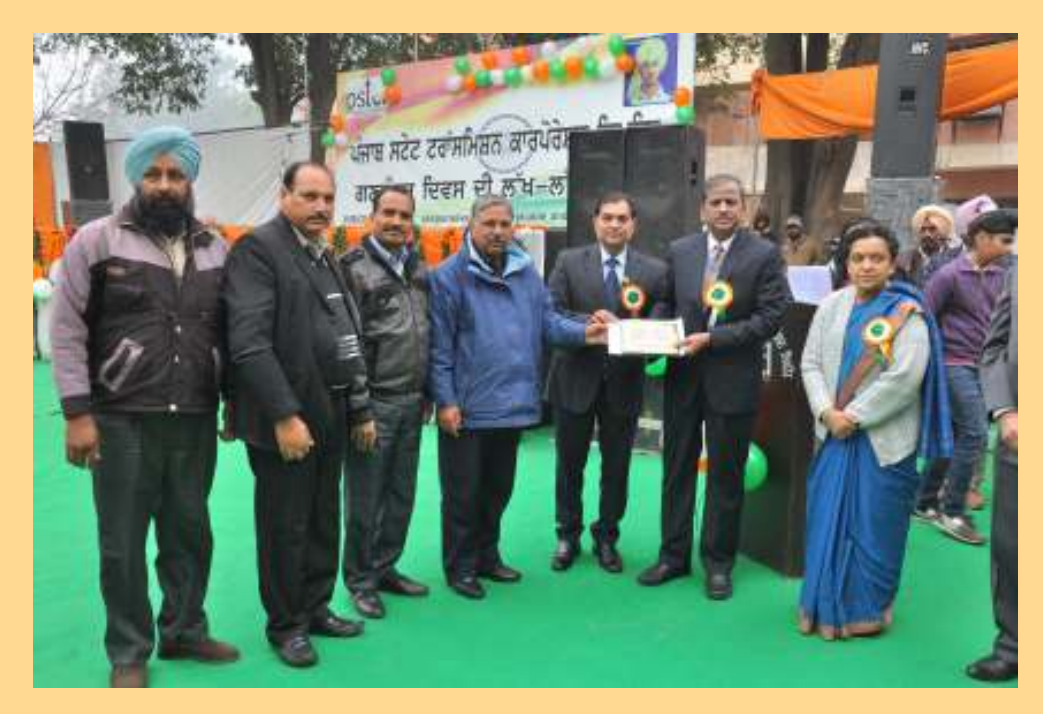
132 KV Nawanshahar-Banga Line